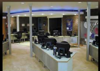
Taskworthy works with many prestigious companies with projects ranging from entire fit outs of reception, retail and office environments to bespoke and contemporary furniture ranges.